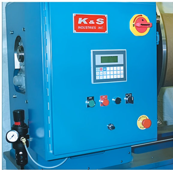
EASY OPERATOR INTERFACE CONTROL PANEL